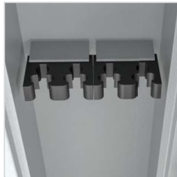
Adjustable rifle holders on magnets (foam holder gauge 55 mm)