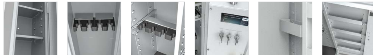
Adjustable shelf Adjustable rifle holders on magnets (foam holder gauge 55mm) Adjustable rifle holders on rail (foam holder gauge 65mm) Hook bar Storage boxes Storage boxes on door